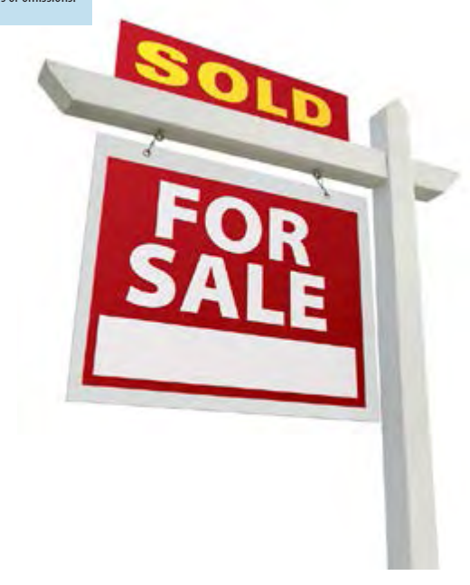
...continued on page D12

3878 Paseo Grande, $1,087,000, 4 Bdrms, 2008 SqFt, 1972 YrBlt, 8-5-16; Previous Sale: $739,000, 09-04-02